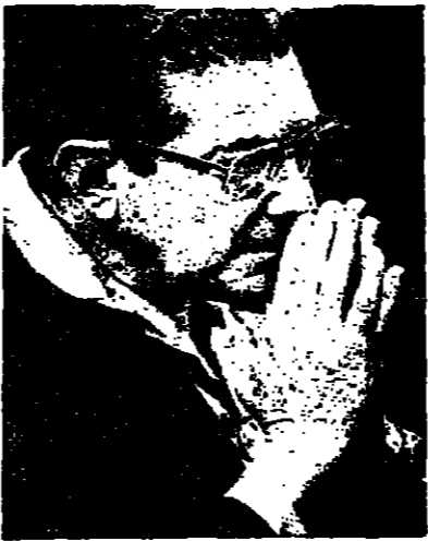
Ezer Weizman (Rubinger)

The disappearance of Defence Minister Ezer Weizman from the peace scene is causing great puzzlement. The Post's MARK SEGAL and HIRSH GOODMAN consider the possible reasons.